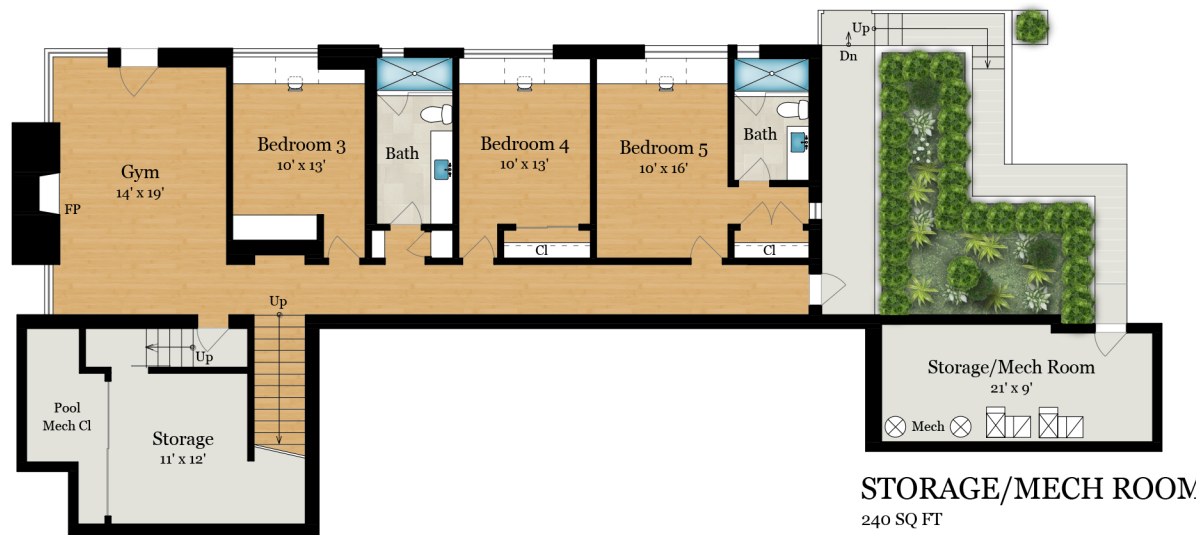
MAIN RESIDENCE LOWER LEVEL 1,405 SQ FT