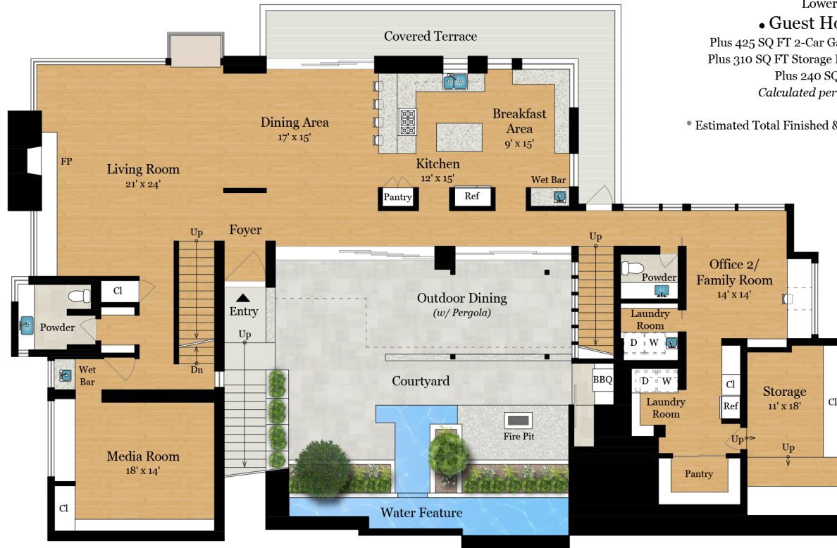
MAIN RESIDENCE MAIN LEVEL 3,080 SQ FT

Estimated Total Finished Square Footage: 7,170 SQ FT Above-Grade: 2,685 SQ FT Below-Grade: 4,485 SQ FT • Main Residence: 6,575 SQ FT Main Level: 3,080 SQ FT Upper Level: 2,090 SQ FT Lower Level: 1,405 SQ FT • Guest House: 595 SQ FT